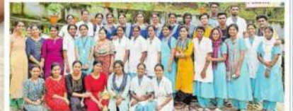
സ്റ്റുഡന്റ് നഴ്സസ് അസോസിയേഷൻ കോളെ സ്റ്റേറ്റ് ബ്രാഞ്ച് ഊസ്റ്റ് സോൺ കലാമേളയിൽ അങ്കമാലയ്ക്കു കേട്ടയം ഗവ. നഴ്സിംഗ് കോളേജ് ടി.